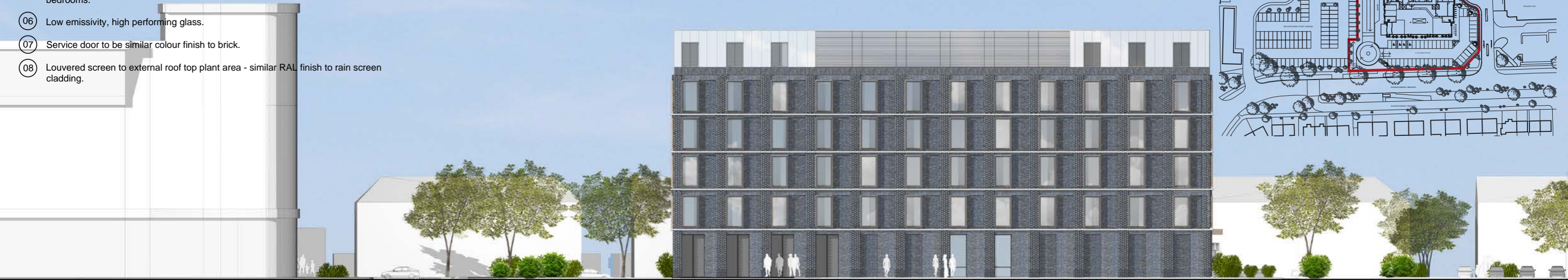
Site impression -North facing elevation