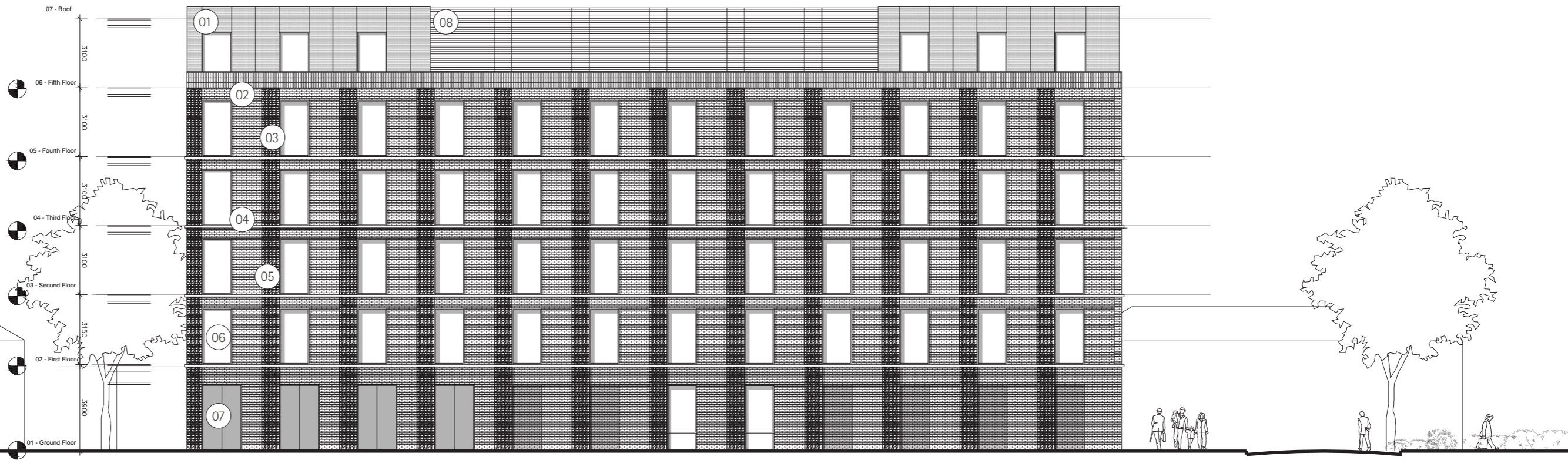
Scale 1:200 – North facing elevation detail